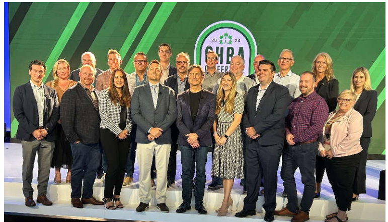
The newly elected Board of Directors Ontario Home Builders' Association